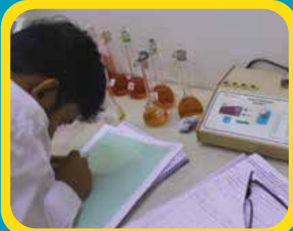
Analytical Chemistry Lab