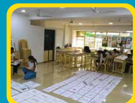
Visual Art Studio